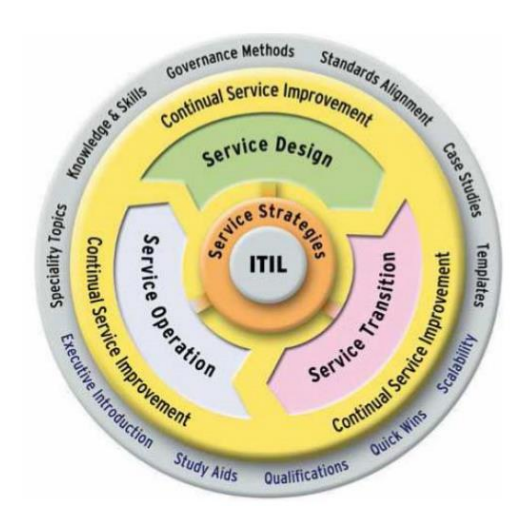
Figure 2 ITIL V3 - The Service Lifecycle

and Continual Service Improvement. ITIL V3 Service Lifecycle can be seen in Figure 2 (Al-Maghraby, 2008):