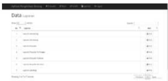
Figure 10 Report Menu

This view shows a list of reports that have been managed by the system.