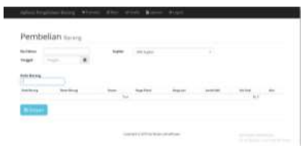
Figure 11 Purchase Menu

This display menu contains data on the purchase of goods from suppliers.