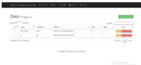
Figure 9 User Menu