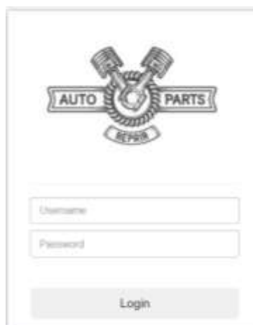
Figure 2. Login