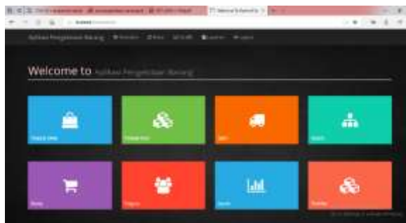
Figure 3. Homepage

Display the main menu after logging into the system.