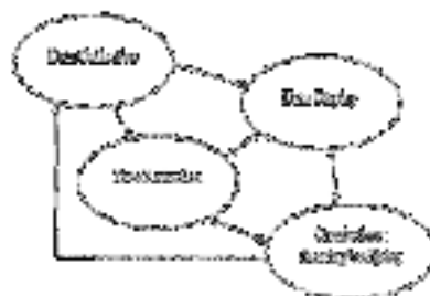
Figure 1 Analytical Procedure (Miles & Huberman, 1984)

The type of mapping chosen is subject/keyword mapping (co-occurrence maps). Chen (2003) in Khoirunissa and Winoto (2022) explains that this analysis is used to calculate the number of keywords that appear in research documents where the frequency of occurrence of these keywords is an indicator of the strength or weakness of the relationship between the documents being studied which is visualized in Figure 2. The data analysis was carried out by following the analytical procedure of Miles & Huberman (1994), namely data analysis starting from the data collection process, data reduction, data display, and conclusions. Data reduction is done by making subtractions from the data obtained during the study by sorting and determining the relevant data using research studies. The next stage is compiling data that has been grouped at the beginning, then analyzed by comparing its implementation with applicable financial accounting regulations or standards. The last process is concluding. The following is an illustration of conducting data analysis in this study.