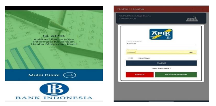
Figure 1 . Login Process View